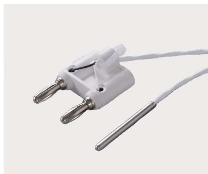
E2308A Thermistor Probe