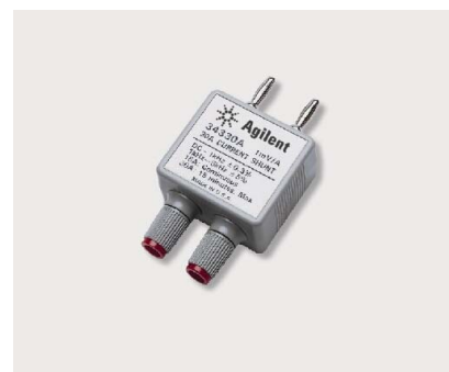
34330A 30A Current Shunt