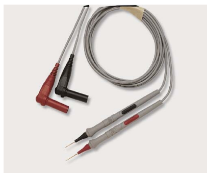
34133A Precision Electronics Test Leads